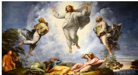
February 11, 2024 – Transfiguration of the Lord BAS Holy Eucharist & Holy Baptism ALL SAINTS ANGLICAN PARISH CBS